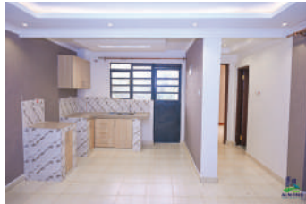
One-Bedroom Type B(540sqft)